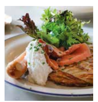
Breakfast Salmon & Rosti Sausage