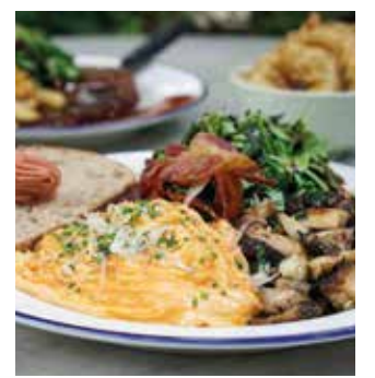
Settlement's Big Breakfast