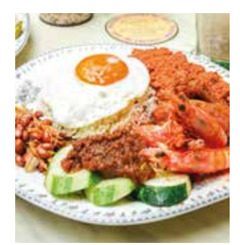
TCS Nasi Lemak