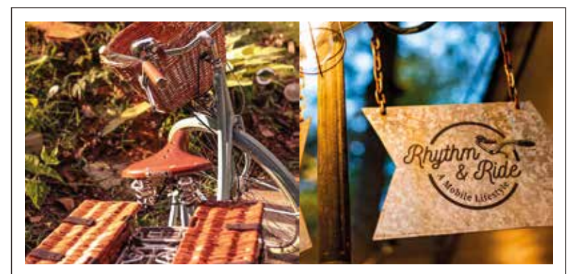
Rhythm & Ride | www.rhythmandride.sg Singapore's official distributor for Pashley Cycles

Sun 8:30am - 10pm (Last order for dinner: 8:30pm) If PH eve falls on a Sunday, we will be closed at 11pm.