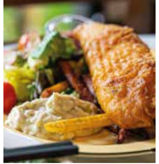
Fish & Chips