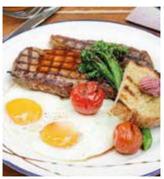
Steak & Eggs