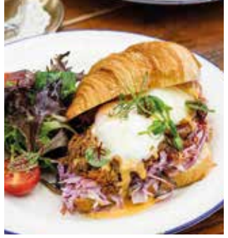
Pulled Pork Benedict