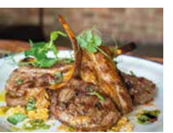
Grilled Lamb Chops