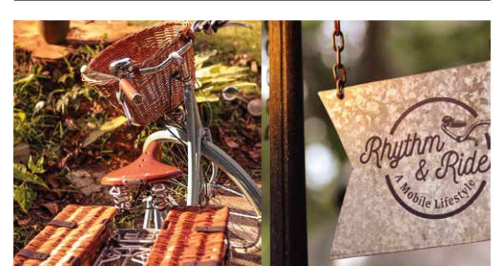
Rhythm & Ride | www.rhythmandride.sg Singapore's official distributor for Pashley Cycles

Over here, it's always picnic season. Joining hands with Urban Journey Co. on this eco-friendly journey, we are bringing you a fuss-free picnic experience with all the essentials ready to go! Each basket will come with a complimentary set of table & 2 chairs, mat, 2 drinks, 2 cakes, hand sanitizer, insect repellant and an additional 10% off our menu. Now it's time to grab your own basket & go on an adventure!