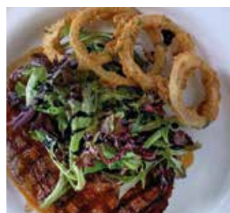
Ribeye Mac &amp; Cheese