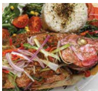
Signature Grilled Fish