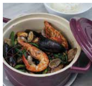
Mala Seafood Pot