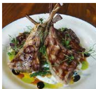
Grilled Lamb Chops