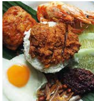
TCS Nasi Lemak