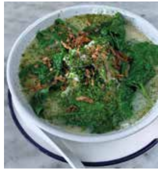
Grouper Fish Porridge & Egg