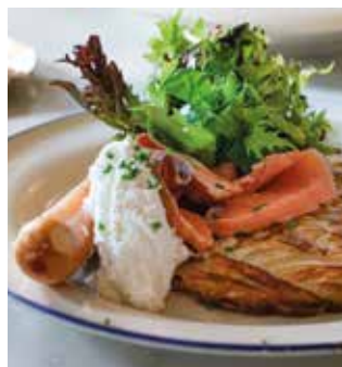
Breakfast Salmon & Rosti Sausage