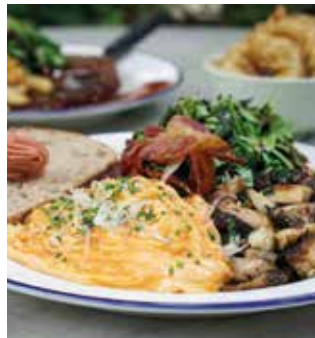
Settlement's Big Breakfast