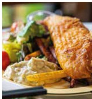
Fish & Chips