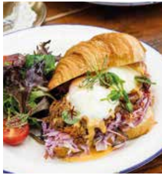
Pulled Pork Benedict